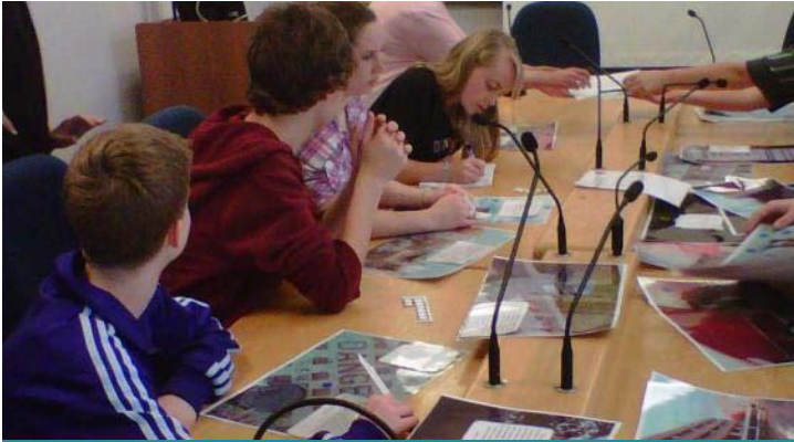
Youth Moving Us Forward