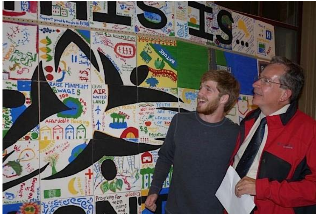
This is MY Ontario