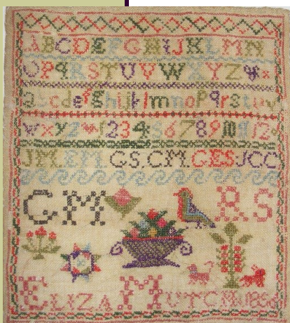
Sampler - 1856 from Scotland.

The sampler and needlepoint were created in the 1800s in Scotland. They have been recently treated by a conservator. The owners, a family in Lakefield, have donated them to Hutchison House.