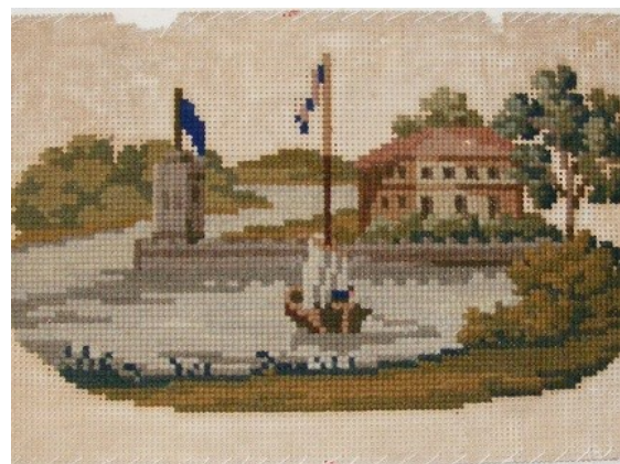
Needlepoint—Mill at Aden Scotland circa 1840s