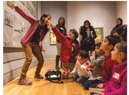
Visit to the AGO through the Institute for Canadian Citizenship's 'Ahlan Canada' program.

While we were developing the Strategy, the Truth and Reconciliation Commission of Canada released its final report, which shed light on the brutalities committed at residential schools and set out a path toward reconciliation for all Canadians. 12 The report exposes the terrible truth that the residential school system was specifically intended to destroy Indigenous identities and cultures. In our discussions with Indigenous partners and communities, we learned that reconnecting children and youth with their traditional cultures and languages is an urgent priority. The Journey Together: