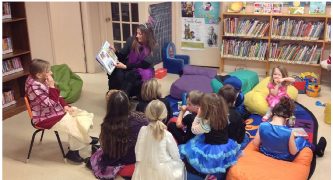
Children learning about the Jewish holiday, Purim.

We learned a great deal through Culture Talks. As we implement Ontario's Culture Strategy, continuing the dialogue will assist us in achieving the goals Ontarians helped us set. We will engage a great many individuals, partners, organizations and communities in that dialogue. By encouraging and facilitating broader collaboration and partnerships, the Culture Strategy will be a catalyst for renewed creative and economic energy in the culture sector and in communities across Ontario.