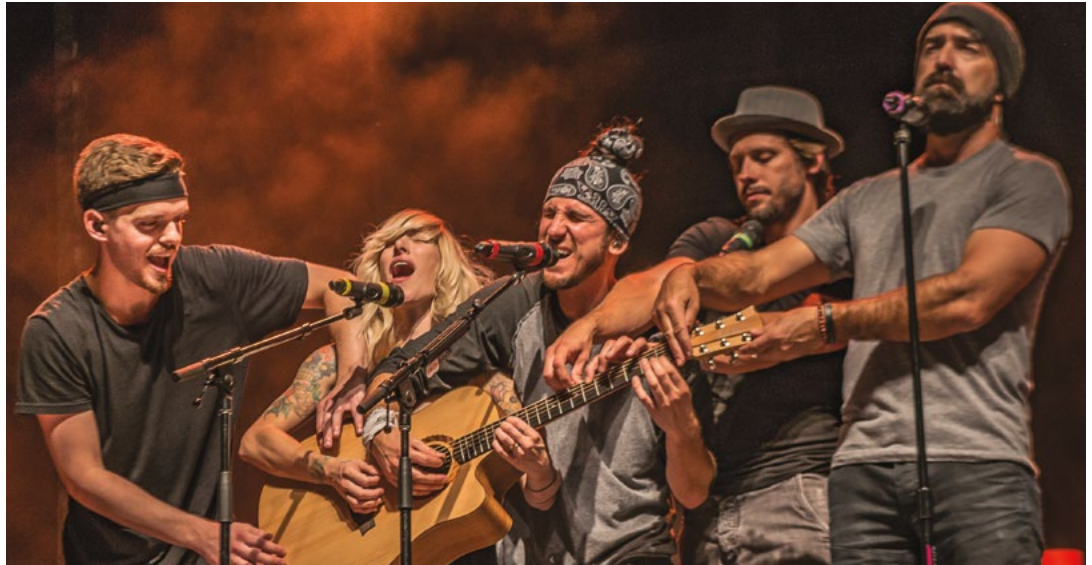
Walk Off The Earth performing at CityFolk in Ottawa.

Ontario continues to work with the Chiefs of Ontario to address issues around Indigenous heritage and burial sites in response to the report of the 2007 Ipperwash Inquiry. 14 We also built on two other critical relationship agreements in developing the Culture Strategy. In August 2015, the Chiefs of Ontario and the Government of Ontario signed an historic Political Accord to guide the relationship between First Nations and the province. The Accord affirms that First Nations have an inherent right to self-government, that the relationship between Ontario and First Nations must be based upon respect for this right and commits the parties to work together on issues of mutual interest. 15