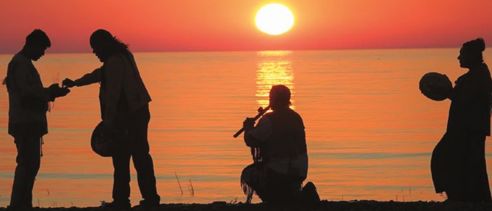
The Global Savages Sunrise Ceremony on Wikwemikong Bay.