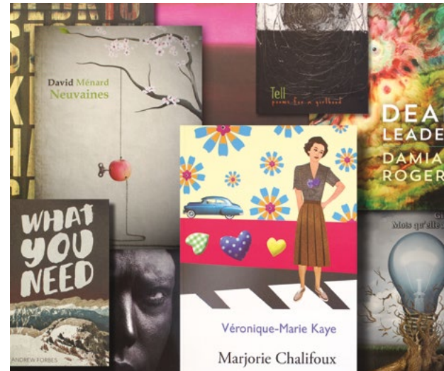
Selection of books shortlisted for the 2016 Trillium Book Award/ Prix littéraire Trillium.