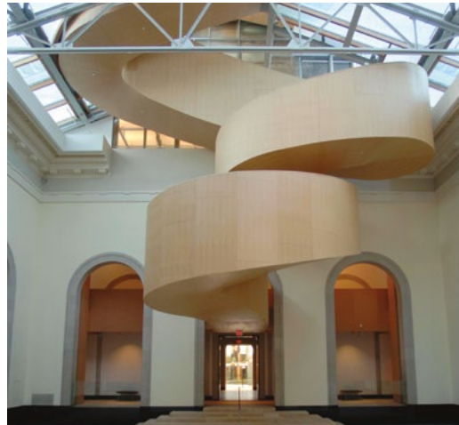
Frank Gehry's sculptural staircase at the AGO.

The Arts Policy Framework will help increase awareness within government of the size, scope and diversity of Ontario's arts sector and of the many opportunities available to integrate the arts into a range of policy and program areas. In turn, this will create new opportunities for artists and arts organizations to engage with other sectors. The Framework will also encourage and support government ministries and agencies to consider the needs and potential contributions of artists and arts organizations when they develop or review policies and programs.