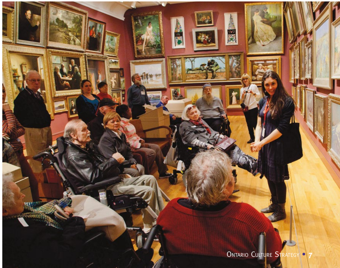
Art in the Moment gallery tour at the AGO.

As our public engagement process made clear, culture is a fundamental, organic and vital part of our lives and our community life. Many people spoke or wrote about culture as a fourth pillar of community sustainability and well-being, alongside social equity, economic health and environmental responsibility. 4 Participation in arts, culture and recreation is an indicator of quality of life in the Canadian Index of Wellbeing. 5