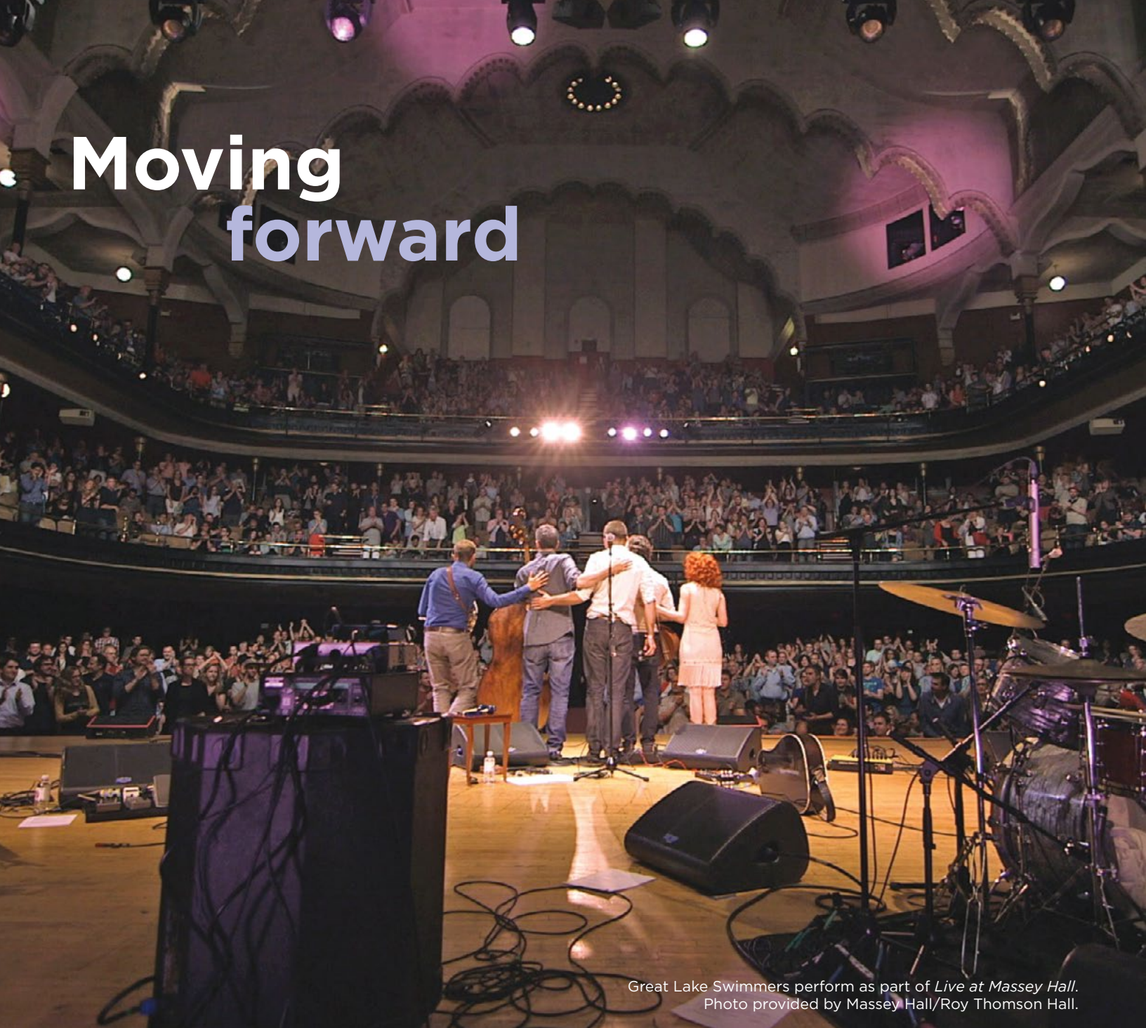
Great Lake Swimmers perform as part of Live at Massey Hall .