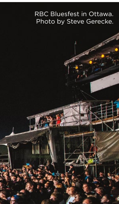
RBC Bluesfest in Ottawa.