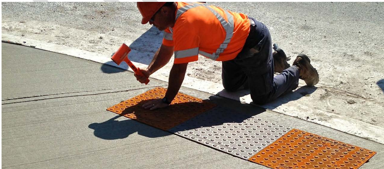
Public Works employee installing a tactile attention indicator in a sidewalk

The City's Accessibility Advisory Committee is also involved in the play space planning process and provides advice on details for each project.