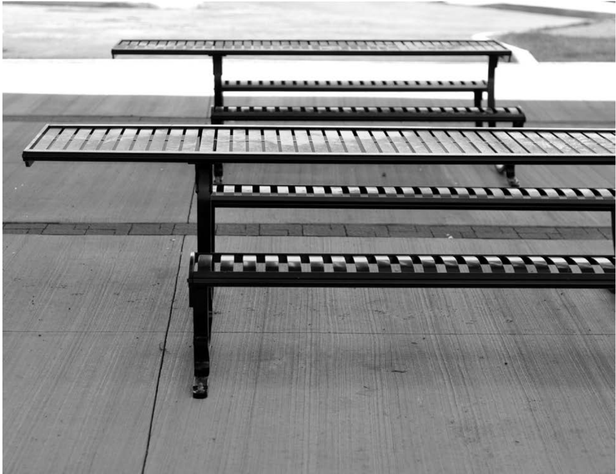
Accessible picnic tables under the Hunter Street bridge