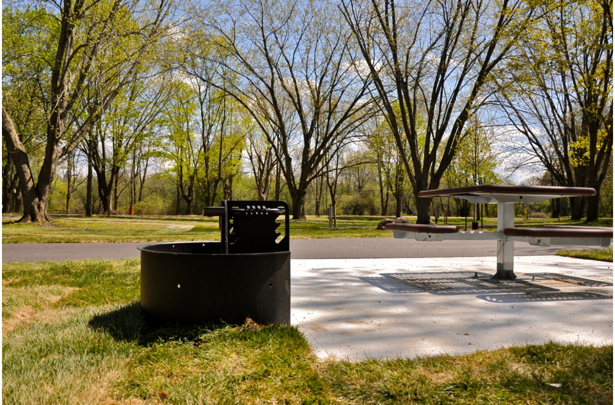
Accessible campsite at Beavermead Campground