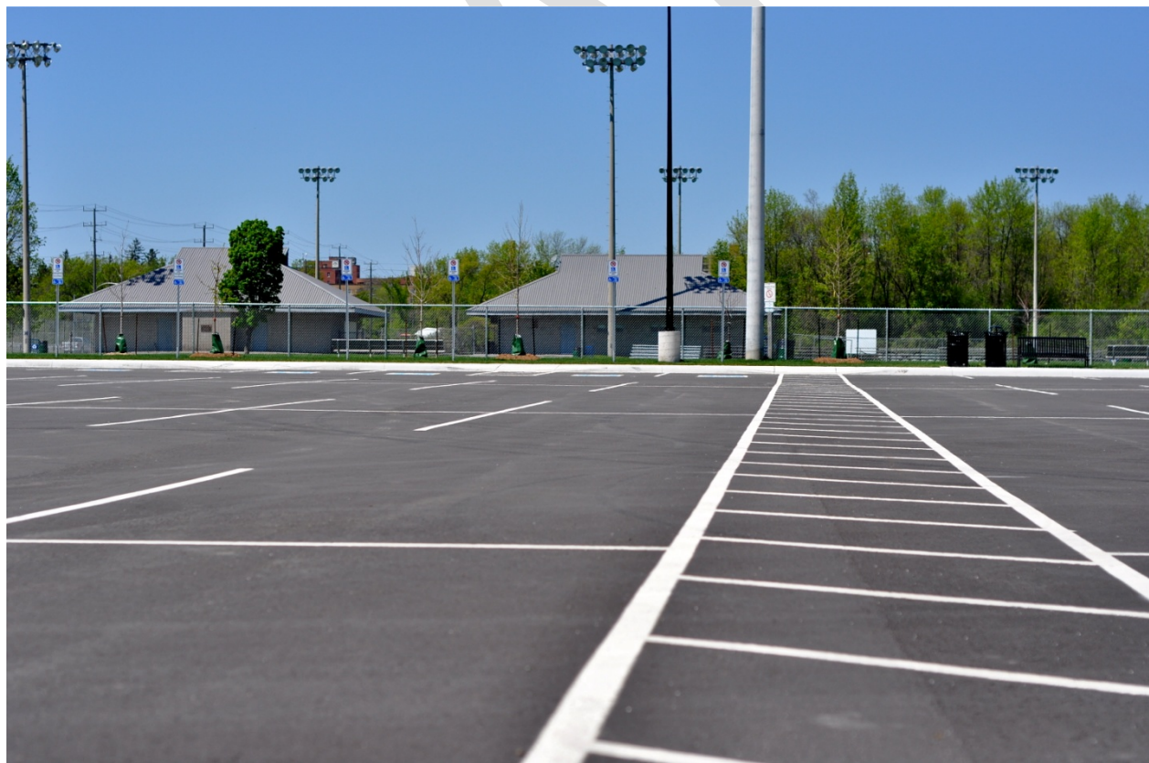
Eastgate parking lot with pedestrian access aisles (located off Ashburnham Drive)

There is also a need to locate and design accessible on-street parking spaces in a way that makes it easy for people to get from their vehicle to the adjacent sidewalk. The City consults on the need, location and design of accessible on-street parking spaces with the public, people with disabilities and the City's Accessibility Advisory Committee.