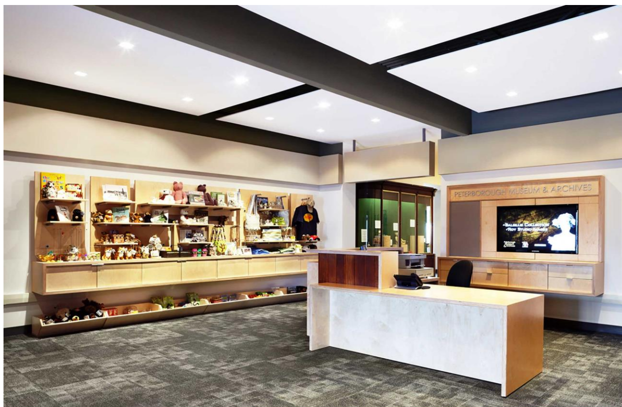
Photo - Accessible customer service desk at the Peterborough Museum and Archives