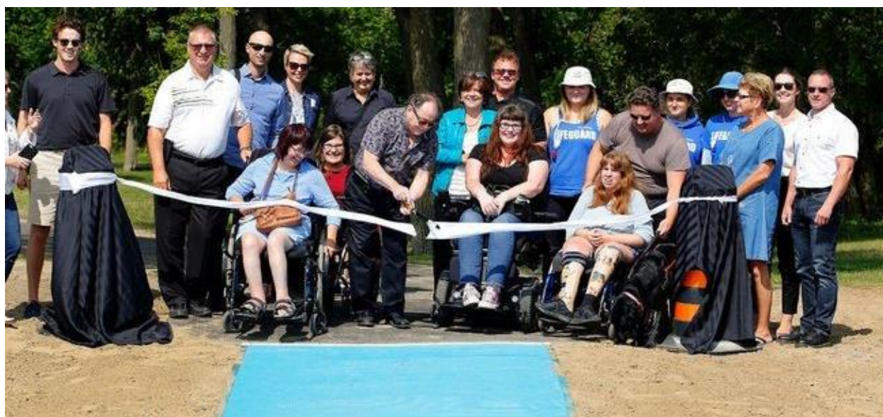
Photo - Beach Access mat ribbon cutting event on Friday August 25, 2017.