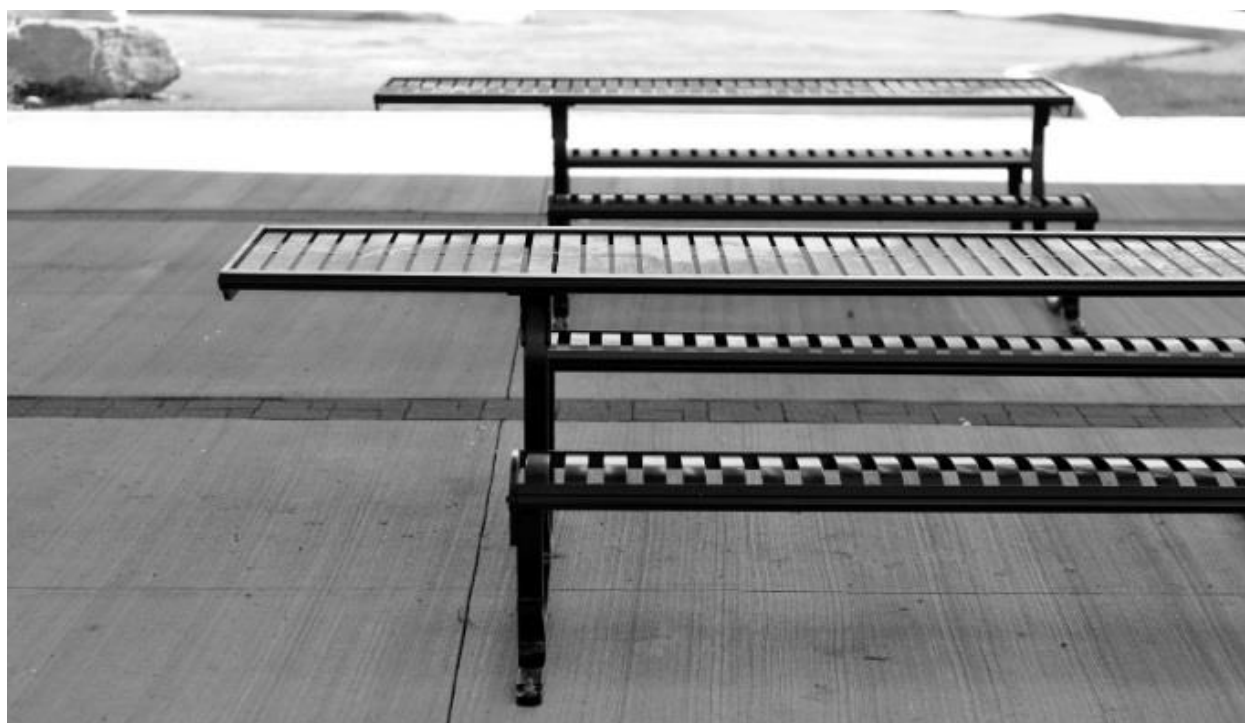
Photo - Accessible picnic tables installed under the Hunter Street Bridge.