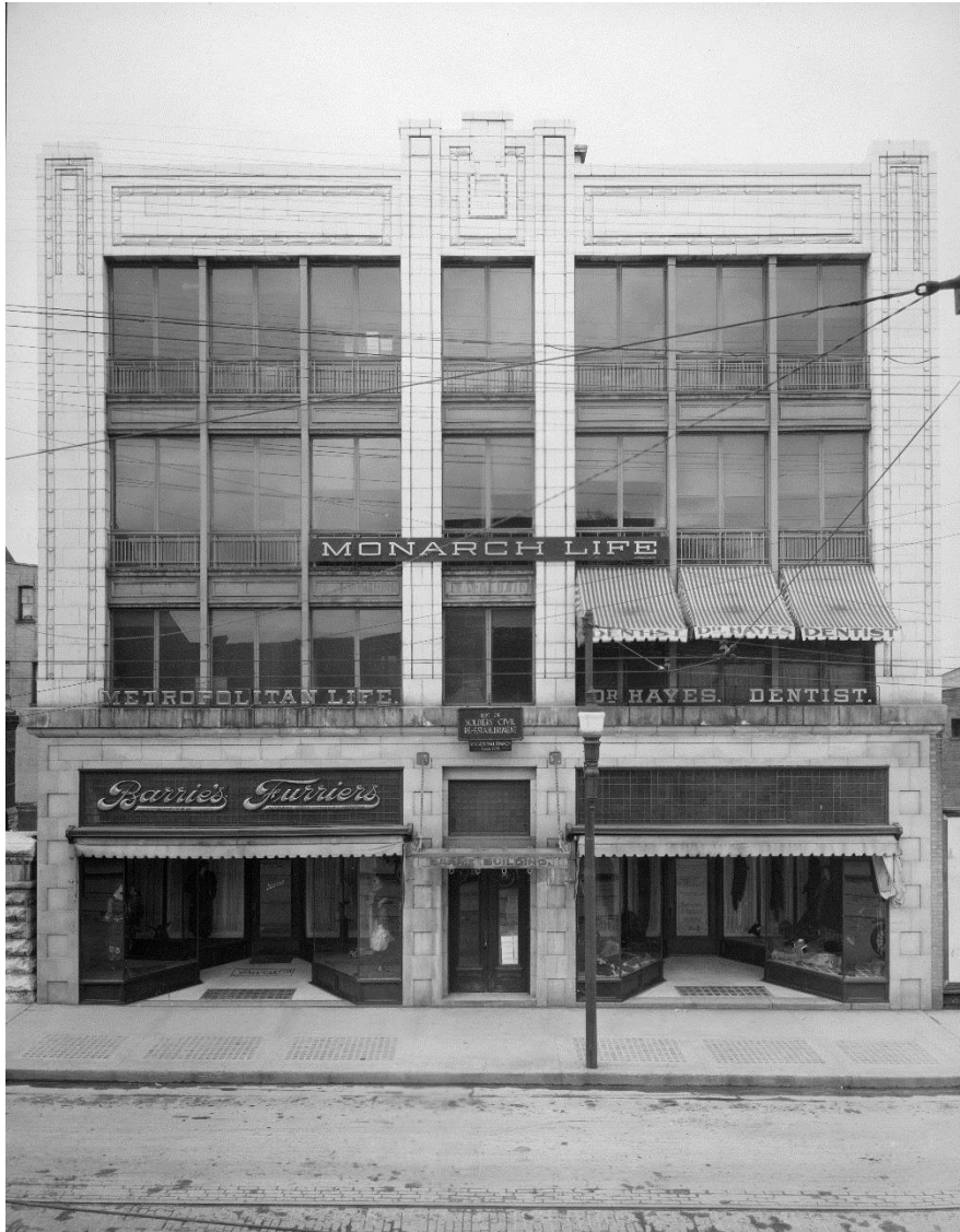
The Barrie Building