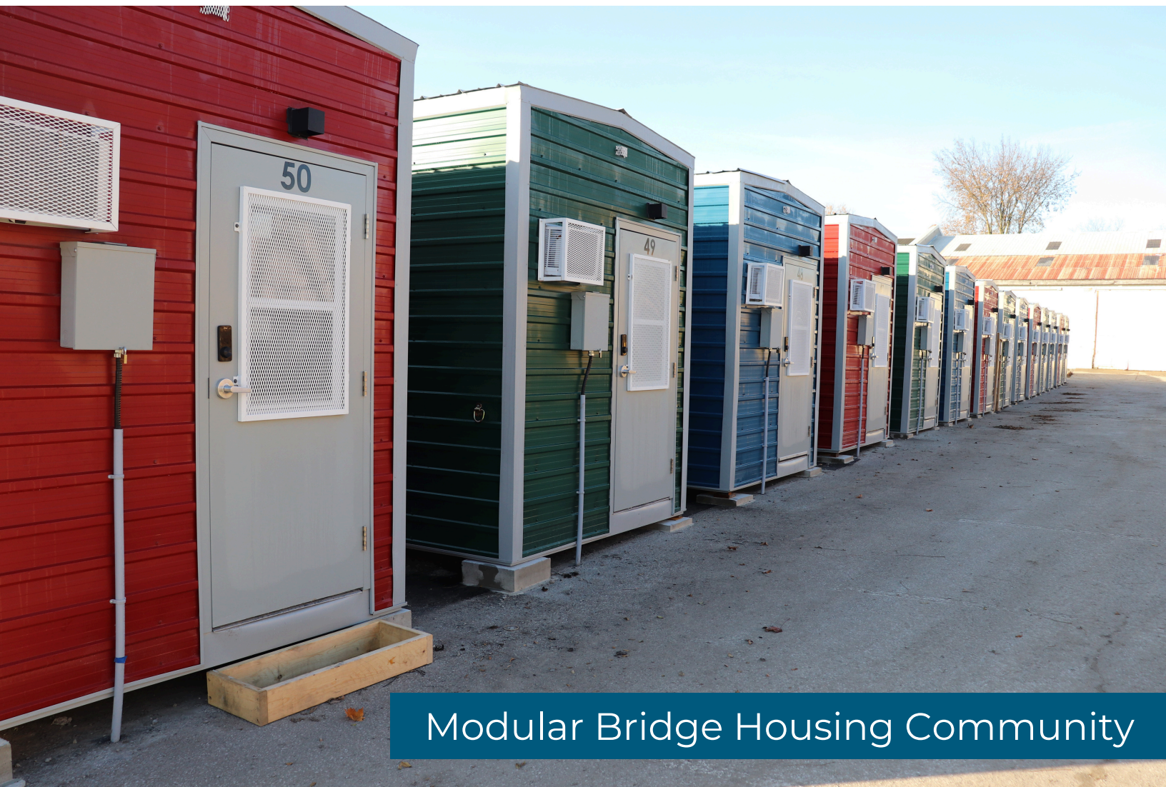
Modular Bridge Housing Community