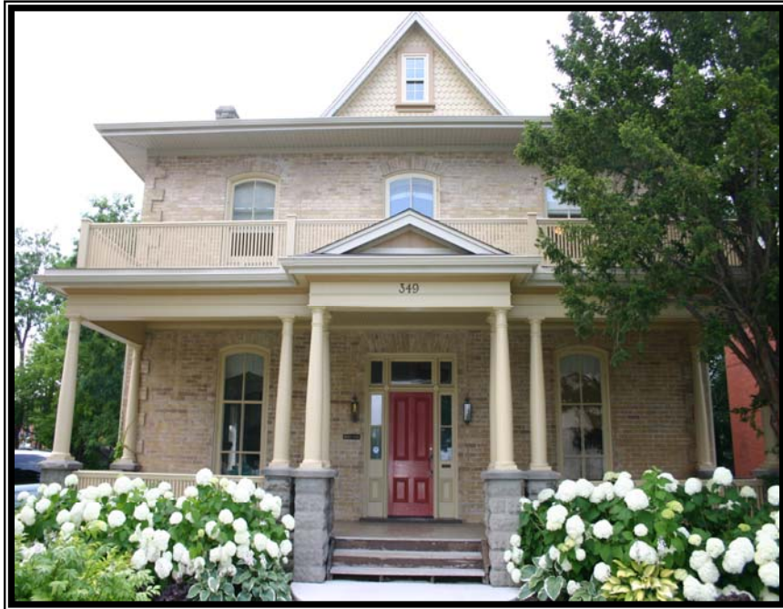
The James Stenson House