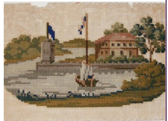
Needlepoint—Mill at Aden Scotland circa 1840s