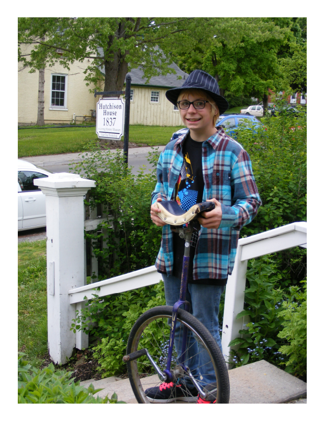
One happy customer