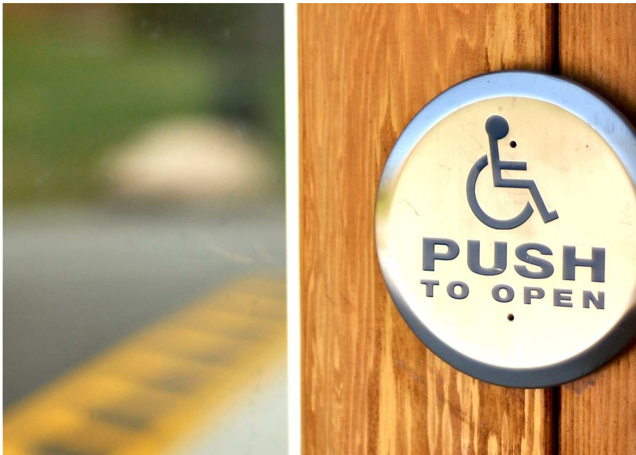
Push button for the barrier-free door operator at the new Curatorial Centre