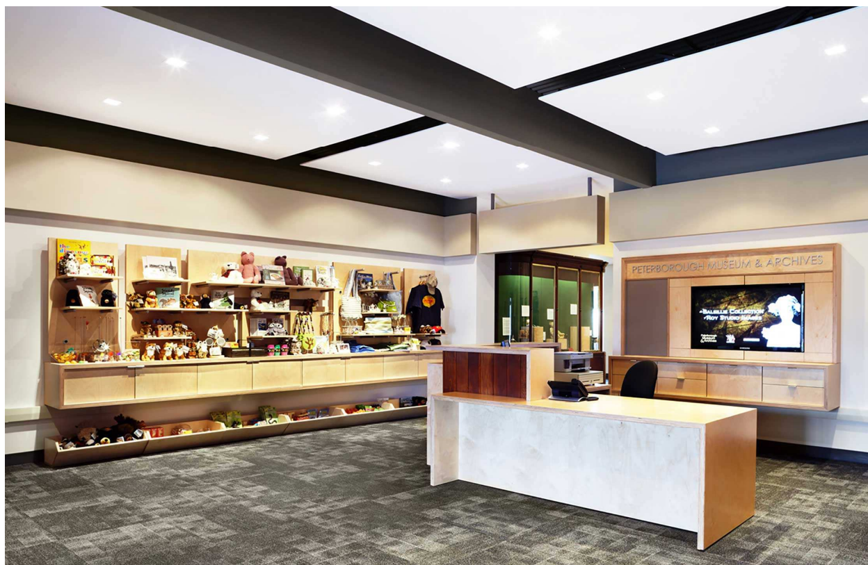
Accessible service counter at the Peterborough Museum & Archives Main building