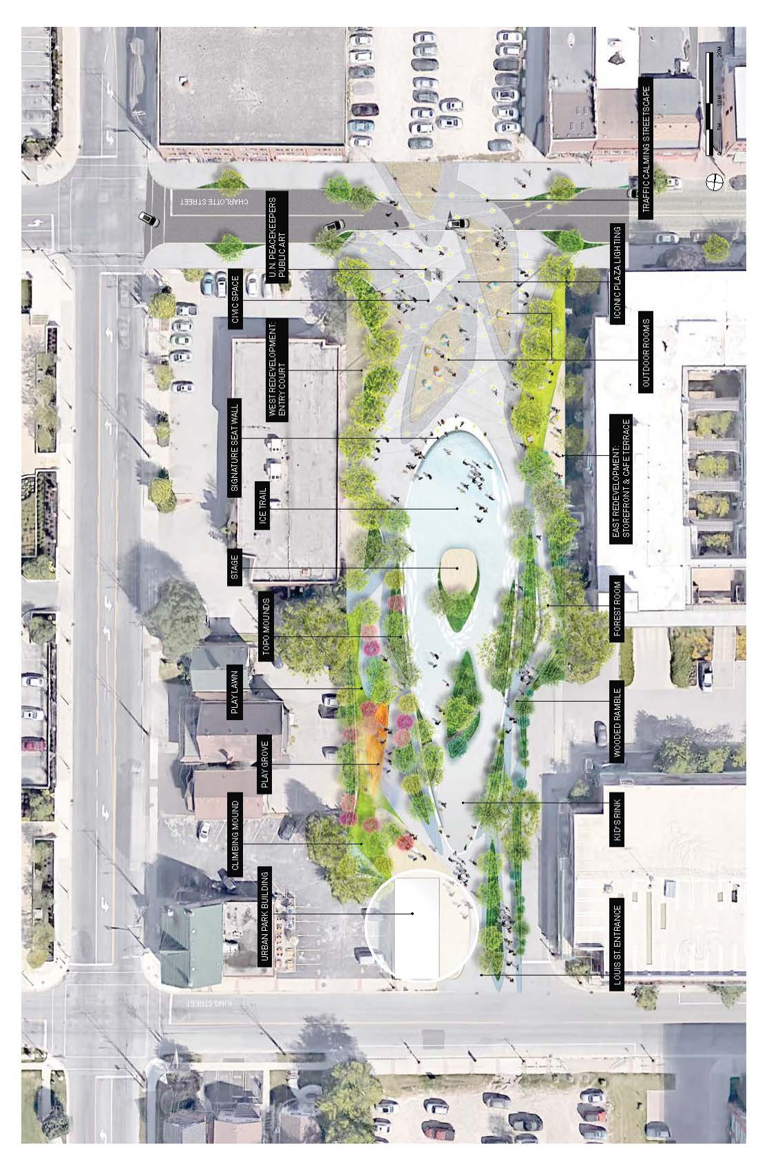
Exhibit A - Conceptual Plan for Urban Park - Page 1 of 1