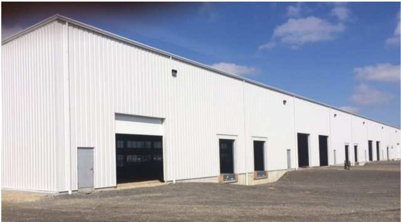
Concept (same builder) of the new facility – (Rear of building)