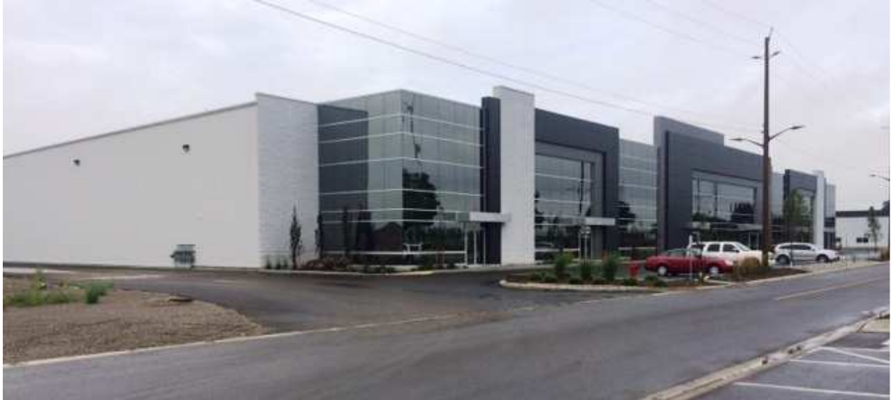
Facility built by the same developer and similar to what is envisioned at Fisher Drive as the multi-tenanted facility. (Front of building)