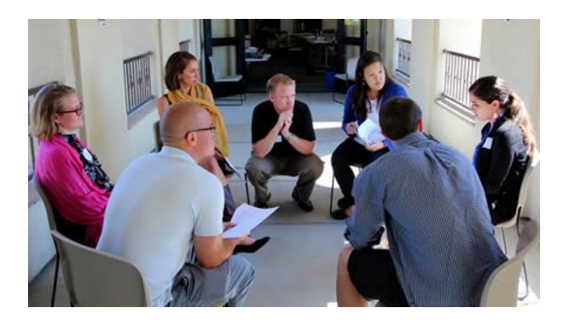
Monthly Listening Circles

Conflict resolution skills & bridge building, increase safety, well-being, resilience.